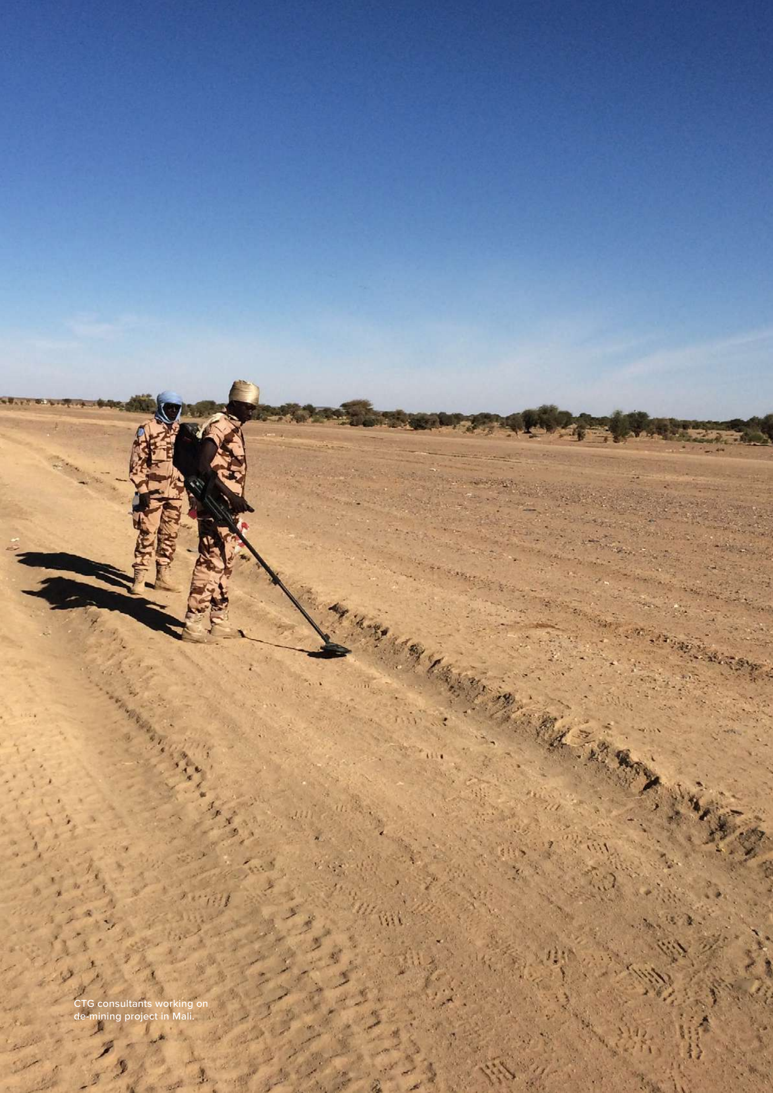
CTG consultants working on de-mining project in Mali.

CTG delivers agile, scalable and cost-effective logistics and supply chain services to support our clients in their work.