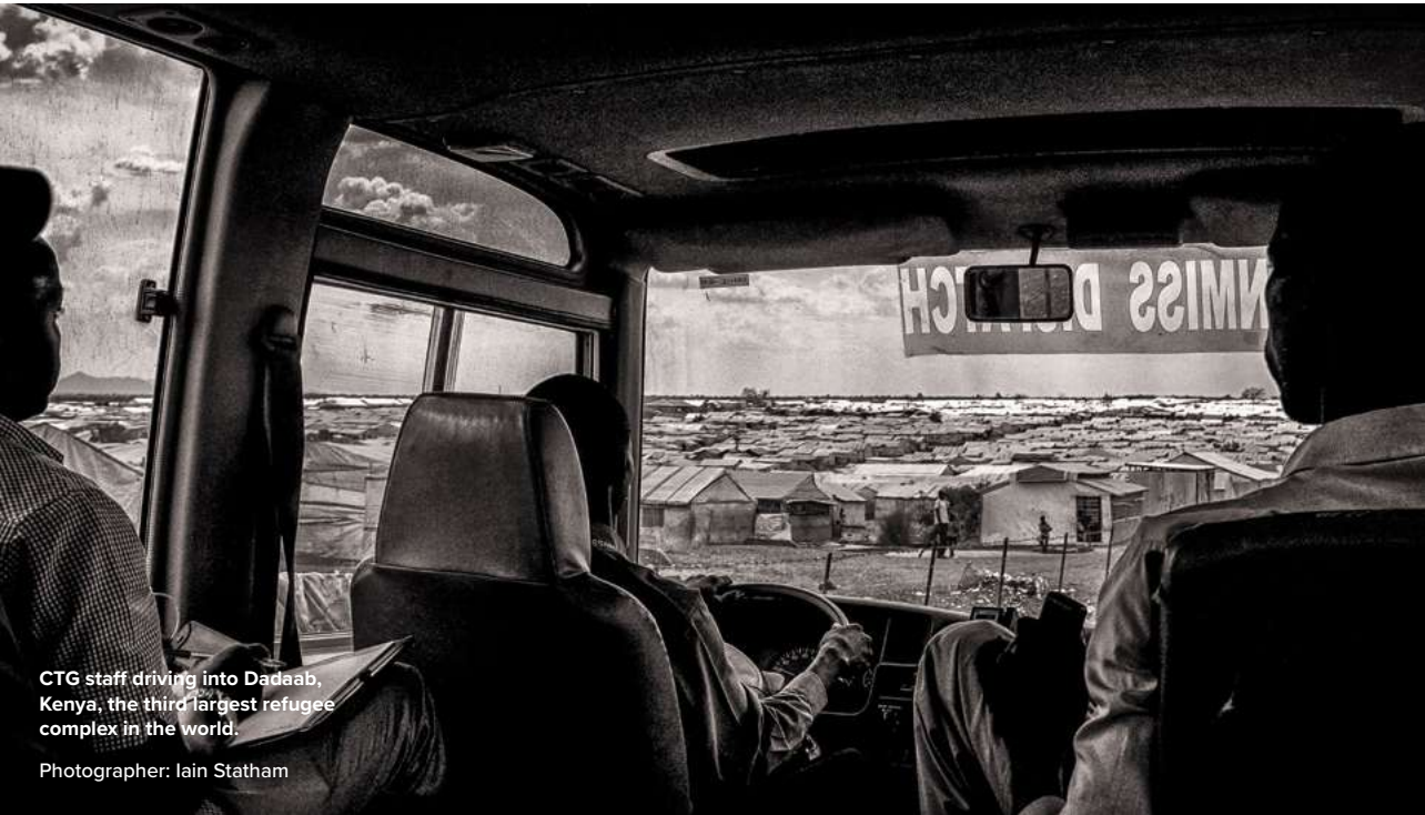
CTG staff driving into Dadaab, Kenya, the third largest refugee complex in the world.